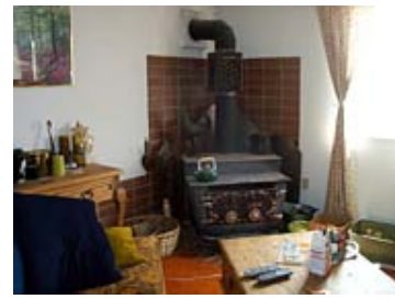
Guest Cottage & Garage