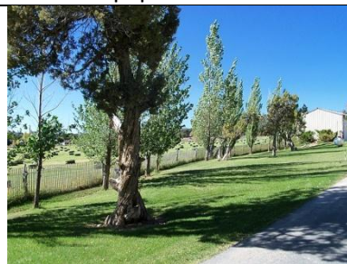
Lawn & Trees lining Asphalt driveway