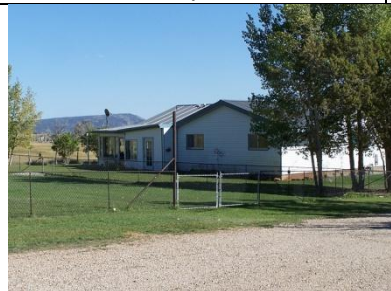
Home Rear Exterior With Enclosed Porch