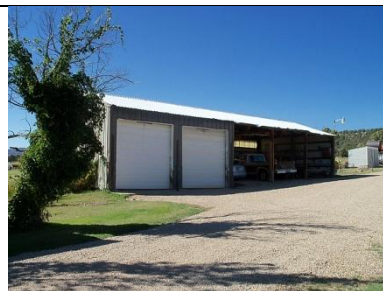
2 tractor garage & equipment shed