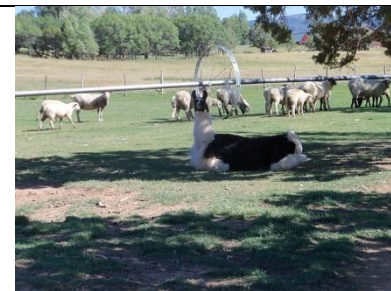
Pasture Cattle-Guard at Entrance