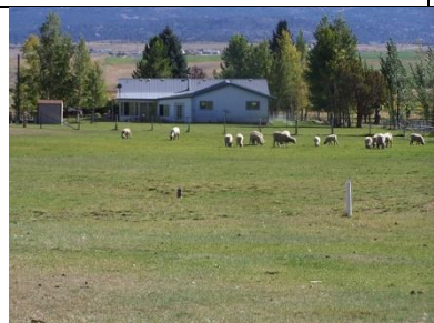
From North to South