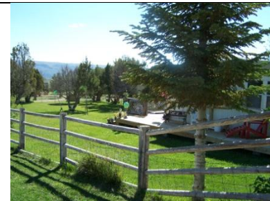
Fenced Yard of Second Home

20 Acres with 16 Shares Red Creek Irrigation