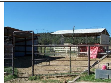
Corrals and Horse Shelter