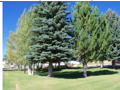
Mature Trees and full sprinkler