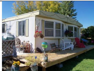
Second Home on Property