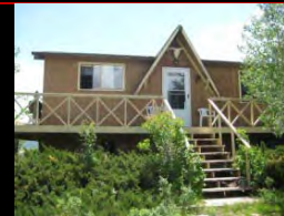
Soldier Creek Estates #19 B $249,900

Built 1976, 1900 sq ft, 3 bed 1 bath, 1.08 acre, Wrap around porch/deck around ¾ of home. Many many trees.