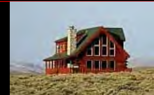
Strawberry Lakeview #51 $349,000

Built 2004, 2207 sq ft, 3 bed 2 bath, 2.47 acres. Custom built, up-to-date interior. Full log cabin w/basement.