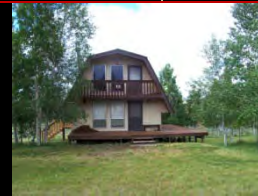
Soldier Creek Estates #17 A $247,500

Built 1983, 1940 sq ft, 1.00 acre, 4 bed, 2 bath, Wood stove, Sub terrain garage and storage. Great condition. Living room opens up to loft, comes furnished.