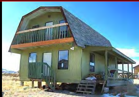
Strawberry Lake Estates #17 B $148,500

Built 1995, 1300 sq ft, 3 bed 1 bath, loft. Ready for sheetrock, power, water, septic are connected. Seller Motivated!