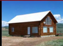
Strawberry Lake Estates #36 B $239,900 - Lakeview

Built 1997, 2362 sq ft, 3 bed, 1.5 bath. 1.06 acre. Log Cabin, all wood interior. Loft & basement for tons of creative room. Great condition.