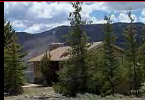
Soldier Creek Estates #28 A $206,000 - Lakeview

Built 1978, 1960 sq ft, 2 bed 1.5 bath, 1.0 acre. Sub-terrain garage, New roof, trex dck, carpet, paint, 50 gal water htr