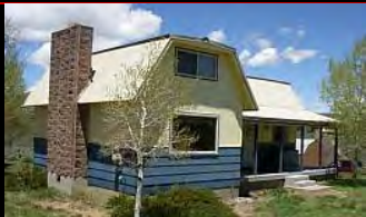
Soldier Creek Estates #20 A $229,900

Built 1978, 2700 sq ft, 3 bed 1 bath, 2 nd floor. Fully furnished. Loft contains two rooms, more room to sleep many. Master vanity w/hot and cold water.