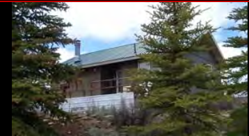
Soldier Creek Estates #26 A $239,900 - Lakeview

Built 1976, 1064 sq ft, 1.10 acre, 2 bed, 2 bath, Kids clubhouse, garage, snowmobile - in & out - storage unit. Year-round water, Central heat/air, 2000 gallon buried propane tanks. Seller very Motivated!